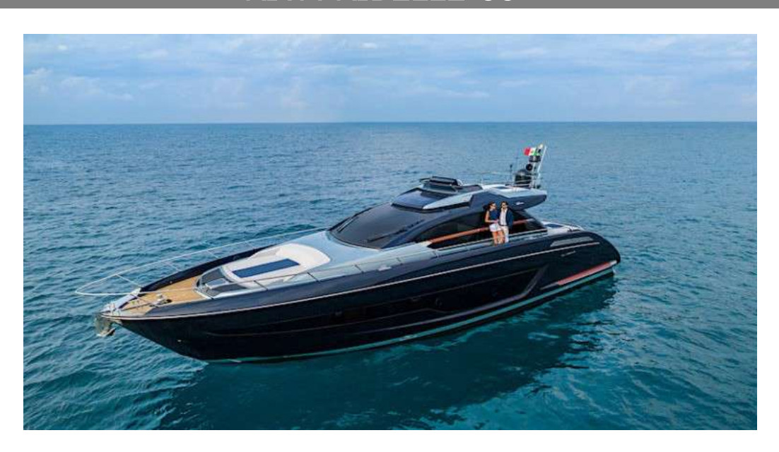
"HULL NUMBER #04"

The Riva 66' Ribelle is more than just a stunning hardtop sports cruiser, it's a masterpiece of design and performance. Sleek and stylish, she hides a cleverly integrated top deck with an upper helm and a spacious sun lounger. The foredeck offers an even larger lounging area, while the aft deck features another, sitting above a generous tender garage. Built for speed and stability, her aerodynamic profile enhances efficiency, while Riva's legendary craftsmanship ensures unmatched reliability. Step aboard and feel the perfect blend of power, elegance, and comfort, because the 66' Ribelle is best experienced in person.